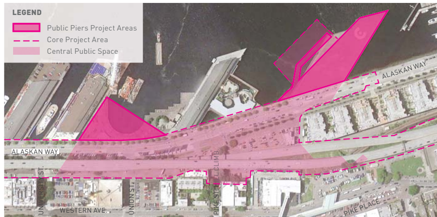
PUBLIC PIERS PROJECT AREAS

The future Union Street Pier and Pier 62/63 will become two important waterfront destinations for several key routes within downtown Seattle. Union Street Pier is situated at the western terminus of a major new east-west connection known as Union Street Improvements which leads into downtown Seattle. Pier 62/63 is situated at the terminus of the future Overlook Walk, which will connect Pier 62/63 with Pike Place Market. Between the two public piers is the Seattle Aquarium, a significant public institution which is connected to the Pike Street Hill Climb, and downtown beyond.