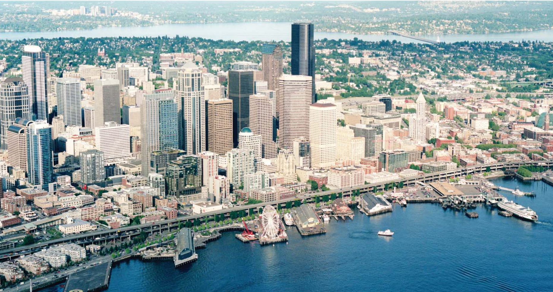
AERIAL PHOTO OF CENTRAL WATERFRONT