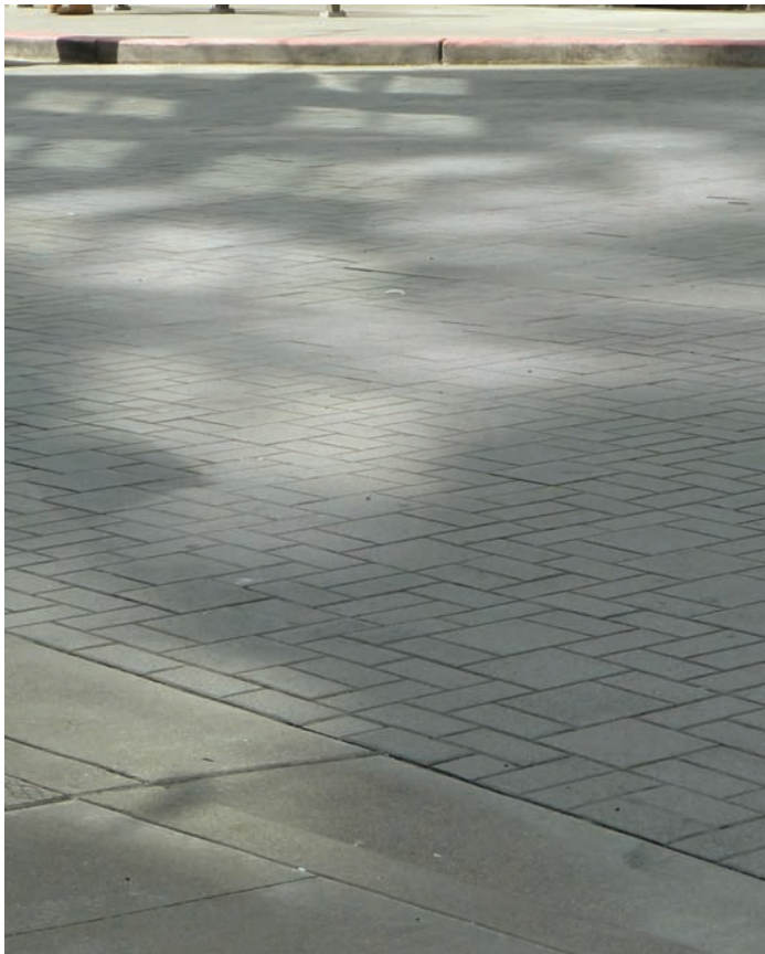
SUNLIGHT REFLECTED ONTO PAVEMENT