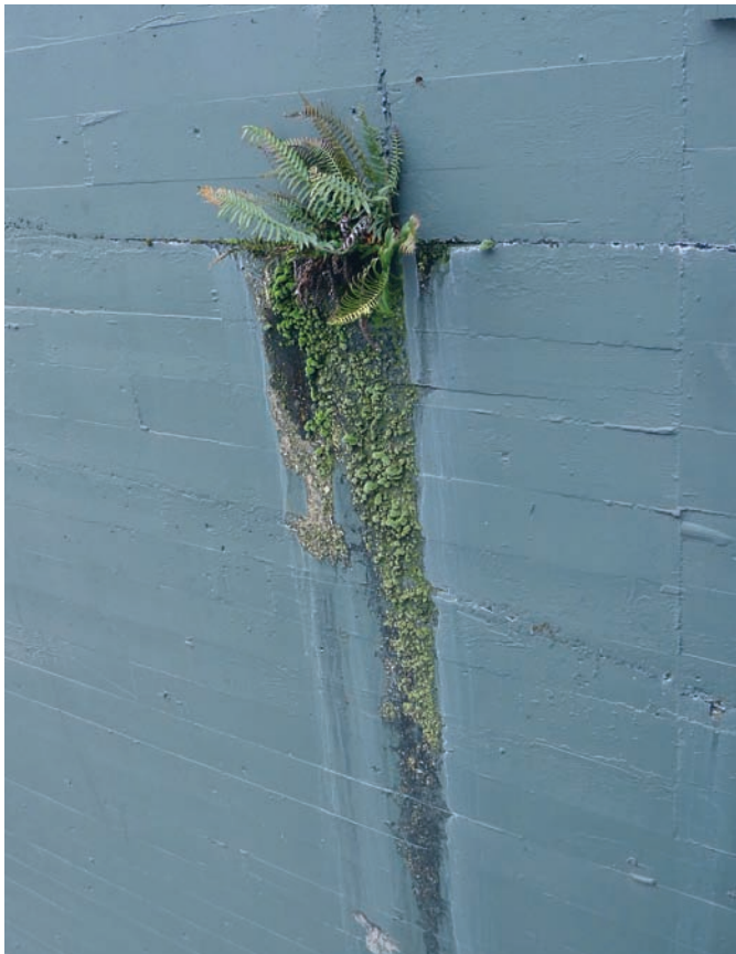
PLANTS ON ANTIQUE MARKET WALL