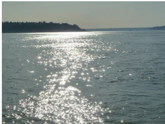
SUNLIGHT ON WATER

The photos below are selected by Norie and represent the concepts she is considering at this initial stage. With the exception of the upper left image, all are from the Union Street site.