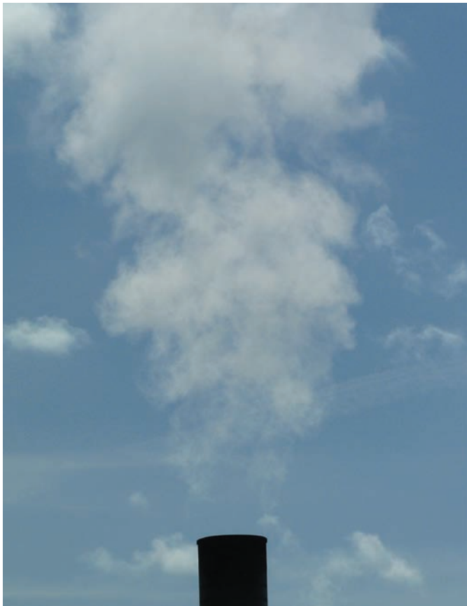
SEATTLE STEAM VENT