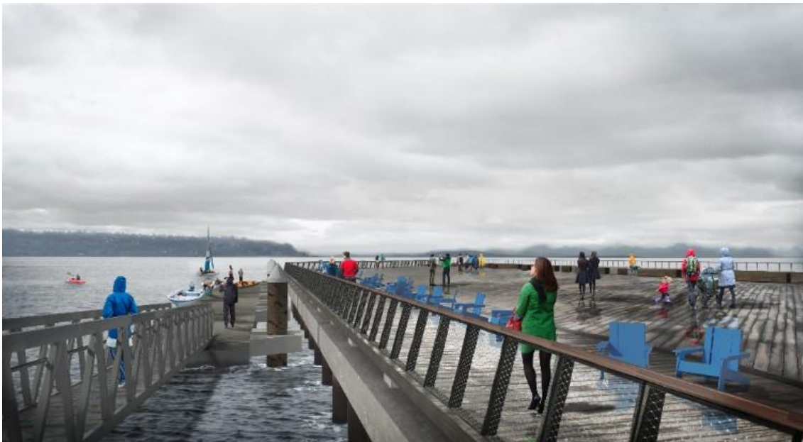
The rebuilt pier will include a new floating dock for access to Elliott Bay.

The initial phase will rebuild the southern half of the pier (Pier 62) while preserving the northern half (Pier 63) in place. This rebuild will replace the aging pilings and deck, provide new railings, lighting and utilities for events, and create a new floating dock for small boats to access Elliott Bay.