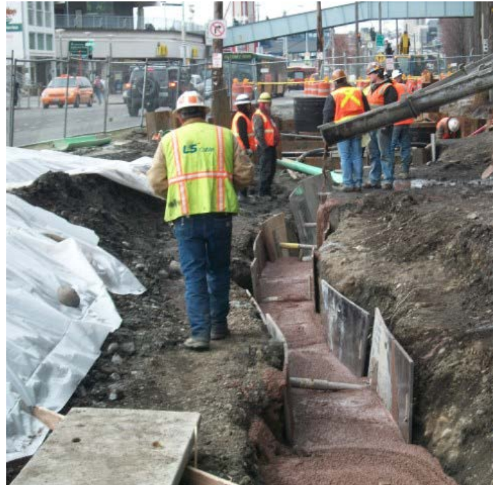
Example of typical utility work

Visit downtownseattleparking.org to find rates, hours and directions to thousands of parking spaces in the area.