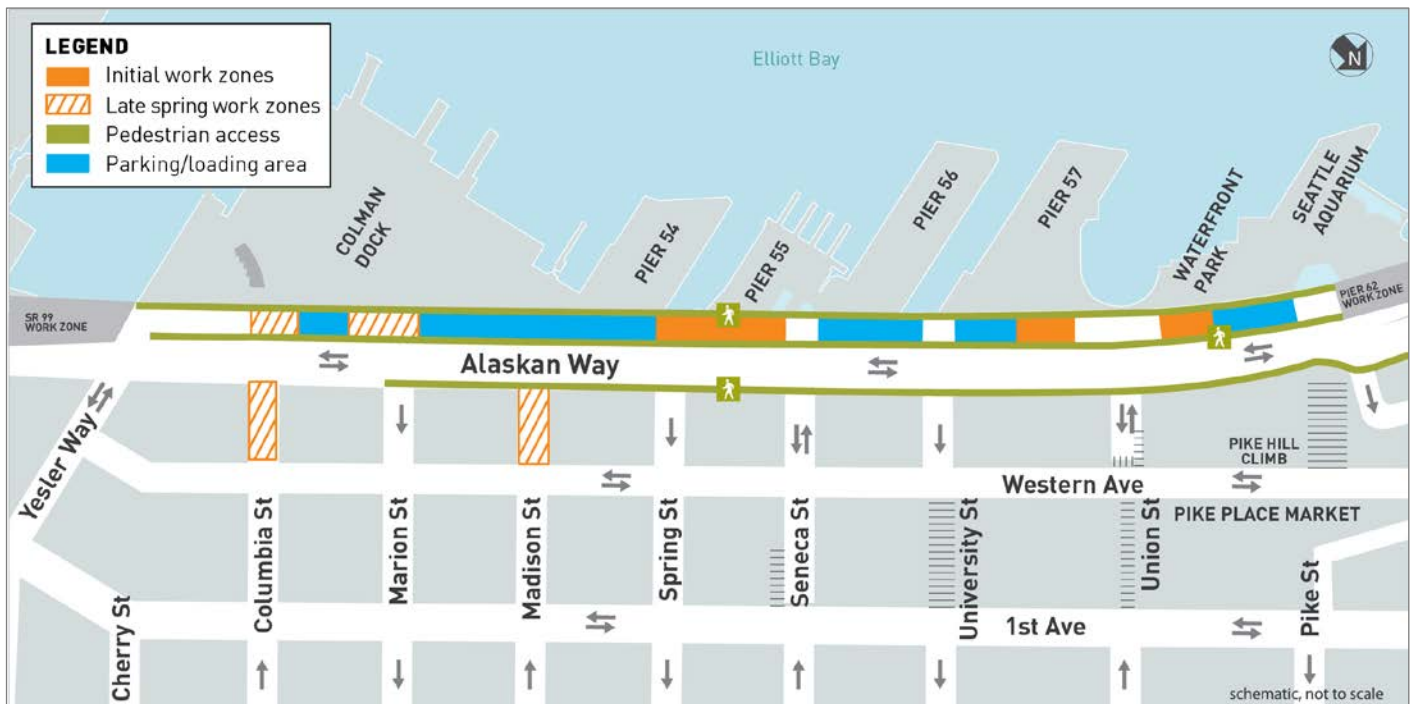
Utility work map. East/west pedestrian crossings omitted for clarity.