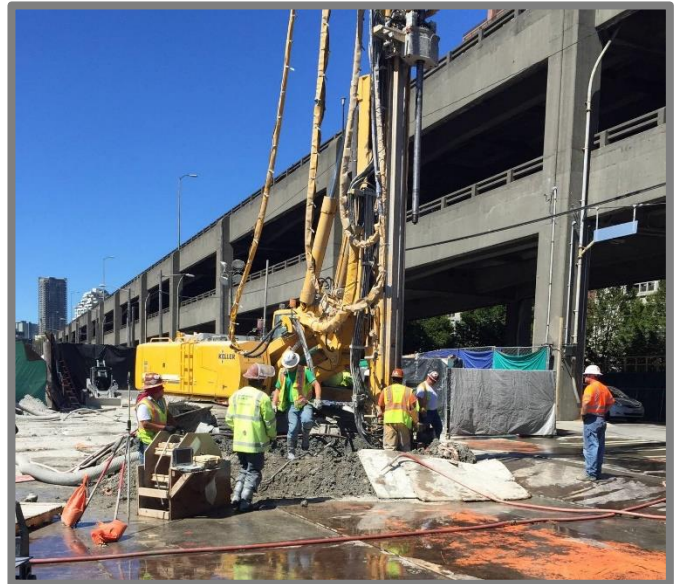
Jet grout work will add seismic stability to the new seawall.