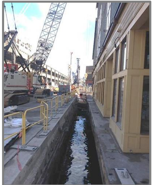
Example of sidewalk removal activities at Pier 56. This is one of the first activities to occur in front of the Seattle Aquarium.

24-hour construction hotline: 206.618.8584 seawall@waterfrontseattle.org waterfrontseattle.org/seawall